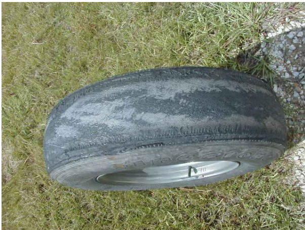
A FLAT TIRE

Note: Tire manufacture date is easy to find by reading the "DOT" code on the sidewall. It is only on one side, so may be on the inside. Read the last 3 or 4 digits. It represents the week (first 2 digits) and last digit of the year, if in the 1990's, or last 2 digits if after 1/1/2000.