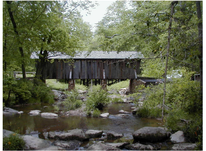
Pisgah Covered Bridge Asheboro, North Carolina