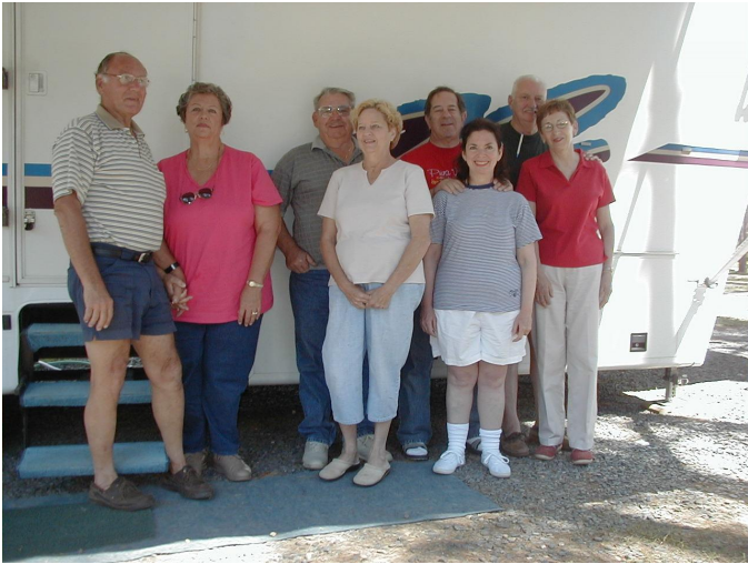
Alfa Sunrises Outing, Zooland Camp Resort Asheboro, North Carolina May 5—10, 2005