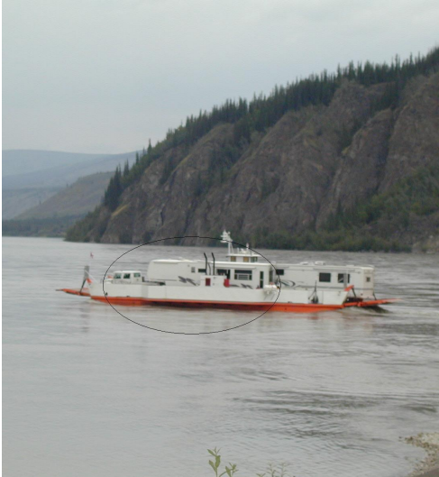
Crossing the Yukon River In an Alfa

Pictures - All the pictures in this, and other newsletters, are available.. Send an email to the Editor and the picture(s) will be returned A S A P.