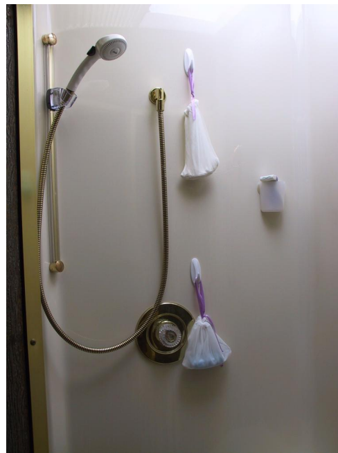
Much better position for the shower head mounting