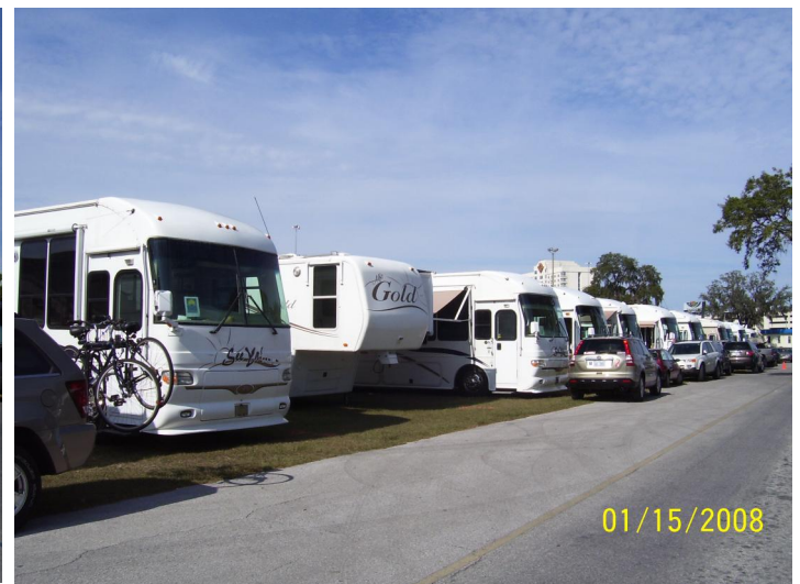
Alfa Street at the Florida State Fairgrounds in Tampa, FL.